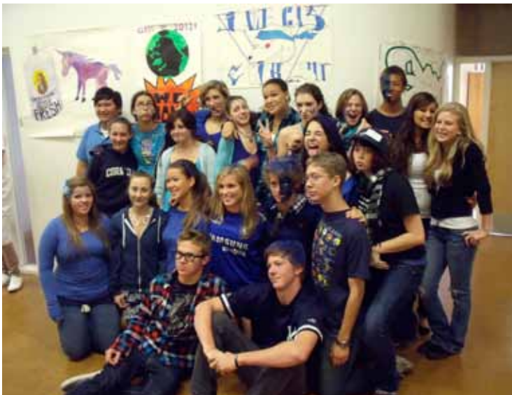
Above: Members of the junior class on "class colors day."