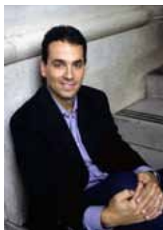
Daniel Pink