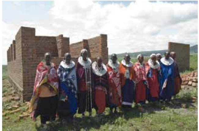
Maasai Midwives & Future Clinic Site.