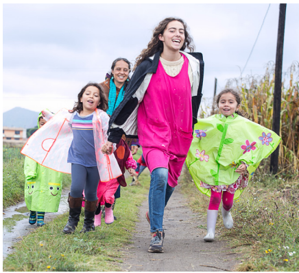
Escuela Raíces children in Mexico. See Alumni Profile on next page.