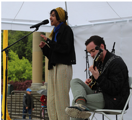
Waldorf 100 Moments. See more on page 5.