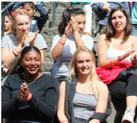
Seniors are on their way! See back cover for college acceptances.